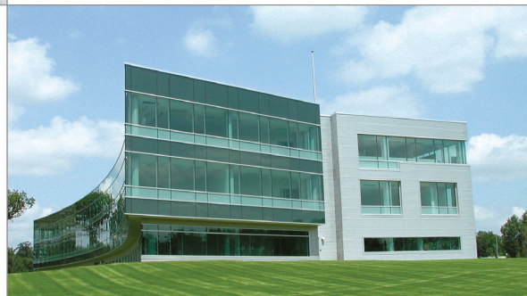
Mindray DS USA, Inc. U.S. headquarters in Mahwah, NJ

Mindray DS USA, Inc. 800 MacArthur Blvd., Mahwah, NJ USA 07430 Tel: 1.800.288.2121 or 201.995.8000 Fax: 1.800.926.4275 www.na.mindray.com