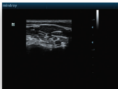
Nerve imaging – pain management