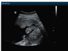
OB imaging – fetal foot

The insightful design reaches a wide range of clinical applications including abdomen, urology, OB/GYN, small parts, emergency, orthopedics, endocavity, and interventional medicine.