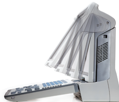
Tilting LCD display allows easy viewing