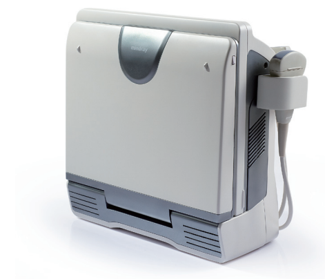
Compact and lightweight for enhanced mobility