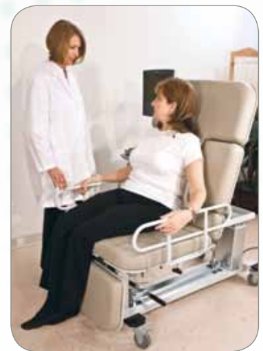
Easily converts to fully upright chair position in seconds!