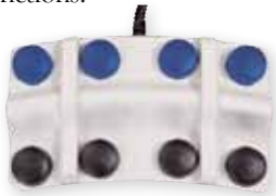
Multi-function foot control

You can add a foot control that controls all functions.