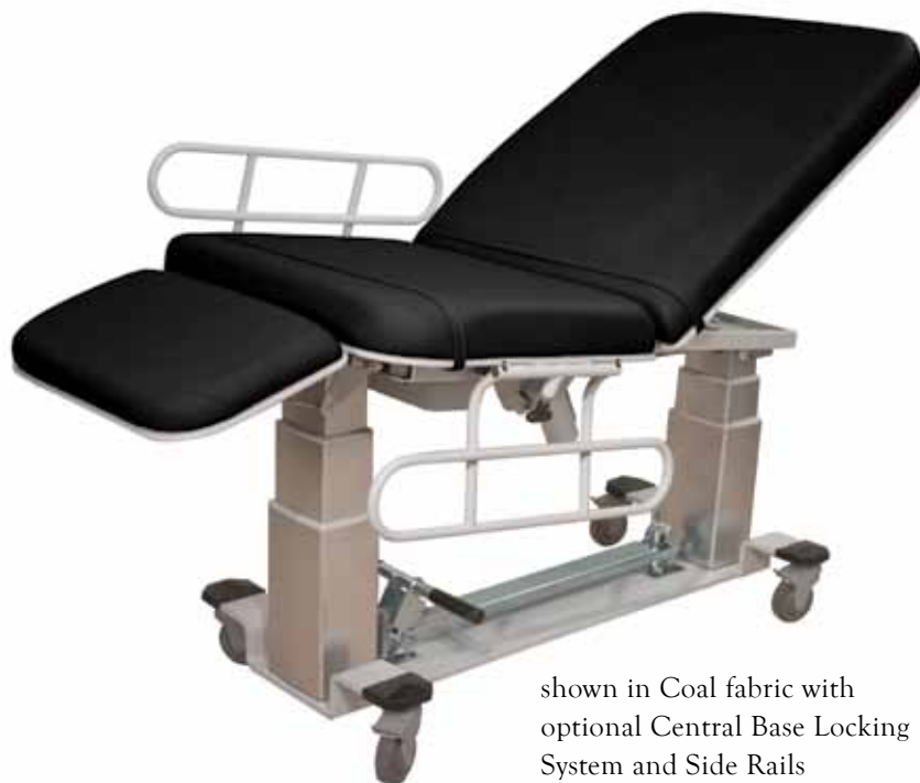
shown in Coal fabric with optional Central Base Locking System and Side Rails