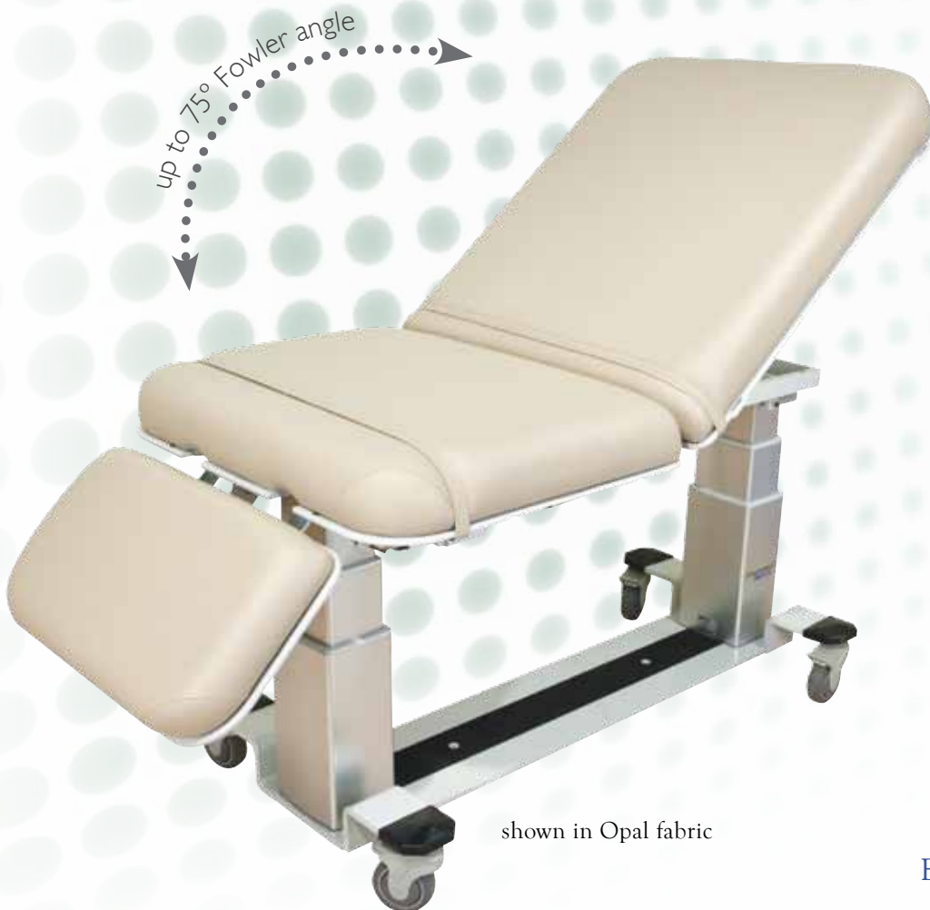
shown in Opal fabric