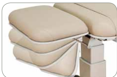
4 Position Leg Section