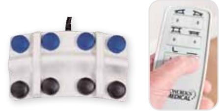
Multi-function foot control

You may choose to have two controls: two foot or one hand and one foot.