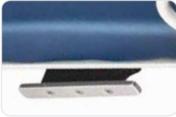
TABLE EXTENDER #63487-T*

Multiple locations allow you to choose the best spot for this easily installed & removed accessory capable of handling up to 150 lb (68kg). Can be used with any American standard accessory. 8" (20cm) long